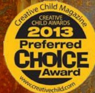
Creative Child Magazine Preferred Choice