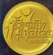
Family Choice Award for excellence in products for children and families