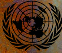
United Nations COP 21 "Song Of The Week Award"