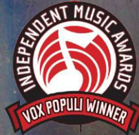
Independent Music Awards "People's Choice" for Best Children's Album