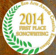
"Best Songwriting" Eco-Arts Awards