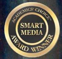
Academic's Choice Smart Media Award for mind-building media